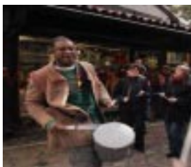
Sarajevo Oct. 2003

For more information visit, www.musicianswithoutborders.nl or info@musicianswithoutborders.nl