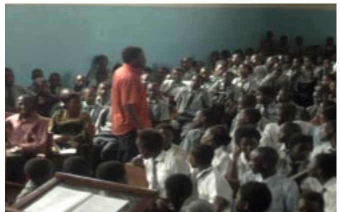
Peace Education Talk in Mufulira City

We have thus far held a successful Peace Education Talk in Mufulira city. We were privileged to have one of the last year's speakers speak at this talk. Again the response was very encouraging and we had students from five schools coming together to attend the talk.