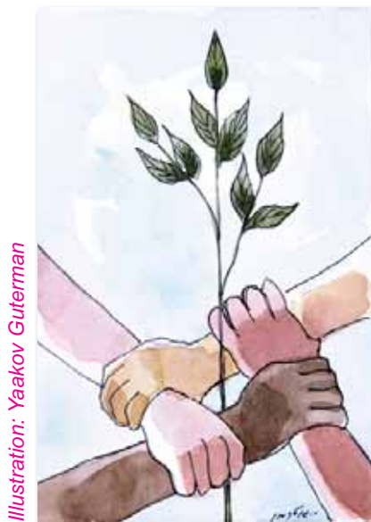
Illustration: Yaakov Guterman

Would you harbor me? Would I harbor you? Would you harbor me? Would I harbor you?