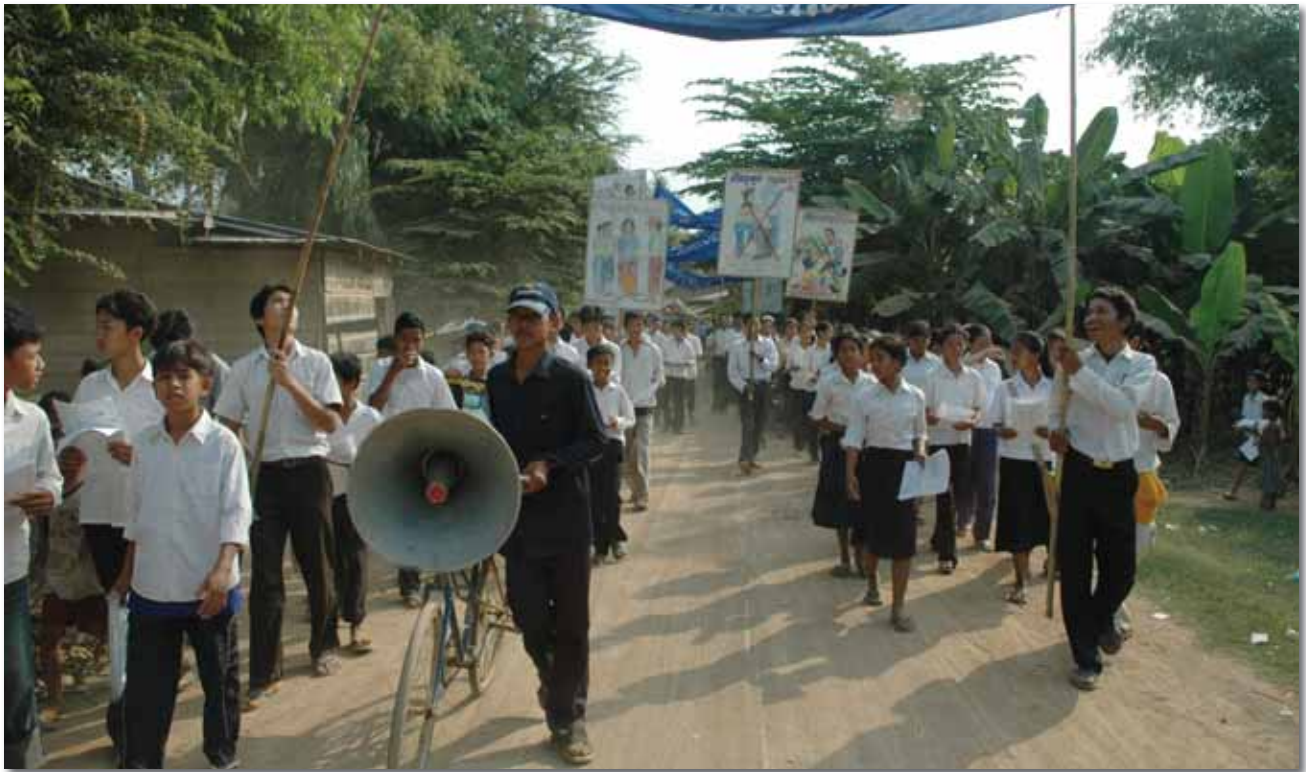
Cambodian Youth marching against Domestic Violence and Drug Use

On May 8th 2008, the Institute of Social Studies (ISS) based in The Hague, The Netherlands, brought together young activists and professionals, who wanted to share ideas and experiences on the role that youth can play in development and change in their own countries.