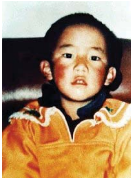
One of the few known photos of Gedhun Choekyi Nyima, the 11th Panchen Lama according to the Gelug sect.

and who have been deprived of their religious leader."