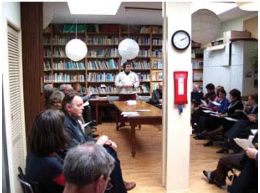
E-FOR Branches, IFOR staff and invited guests meeting in the library of the IFOR Secretariat in Alkmaar, NL.