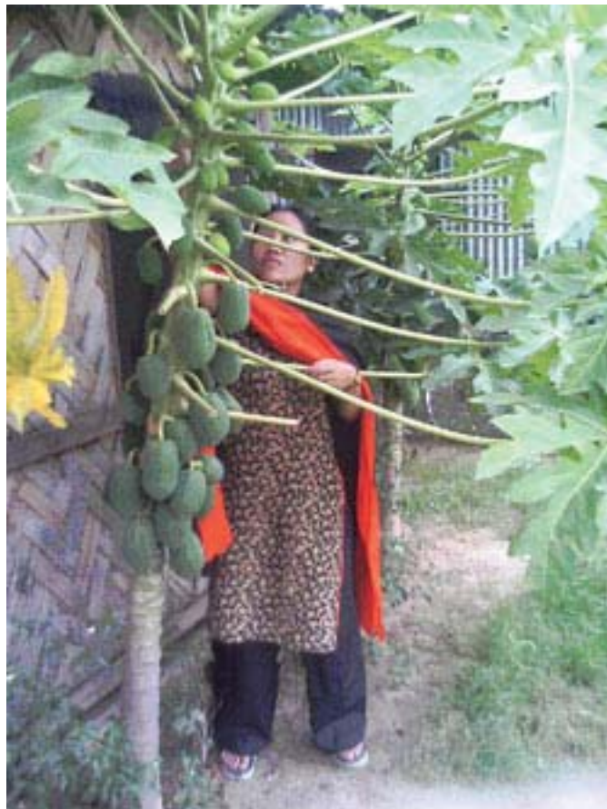
Peace peeps her door through this green intervention.

After 5 months the green papaya starts to ripen with a deep yellow color. What a joy this mother will receive in return from the Papaya! It brings the gifts of creating a new look,