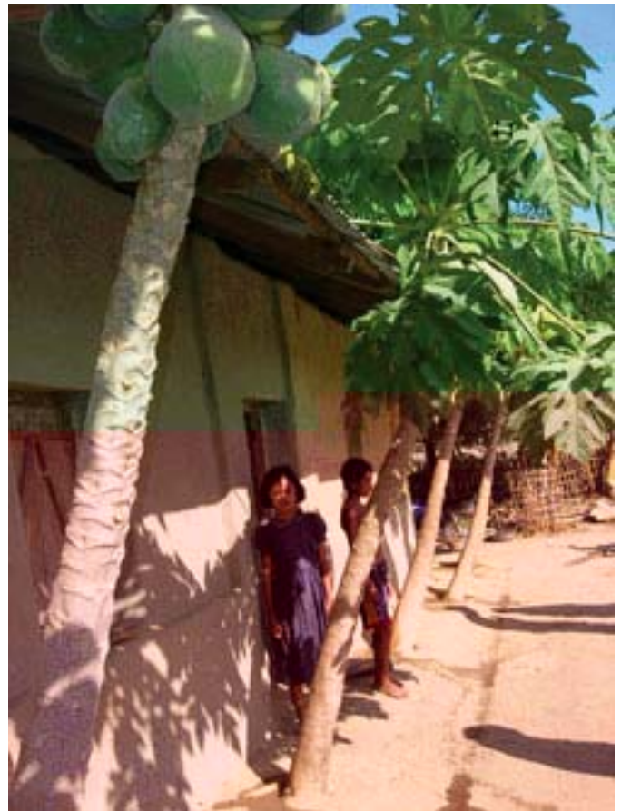
The housewife enjoys not only the scenic beauty but also whole hearted peace of natural gift.

Changing of behavior is not a matter of the moment. It takes time, sometimes a whole lifetime. We may have a lot of living experiences, but seldom do we realize and identify this, ensuring its utilization. Papaya is a fast growing plant and it can be grown an-