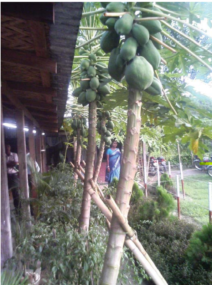
Plants build children's aesthetic make up for future growth.

All images were provided by Francis Halder ■