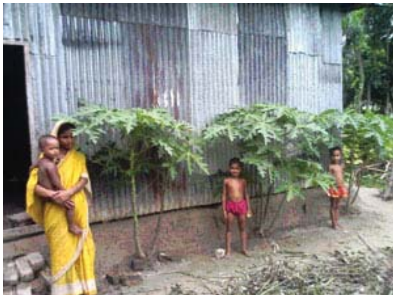
Papaya plants are getting bigger using the house cleaves.

When the papaya plants are more than 8- feet, i.e. above roof level, it is even easier when its existence is also almost untraceable. However, the shrubs, like chili and semi-perennial trees such as pomegranate, etc., could be transplanted in between the papaya plants, depending