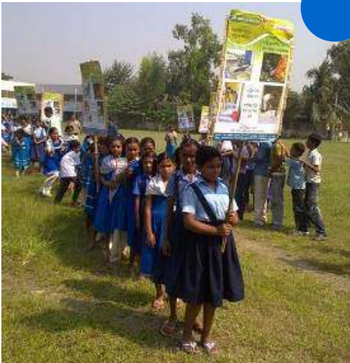
Impressions of BASTOB's Sanitation Campaign

Since 1999, BASTOB has been implementing the Water and Sanitation program (WATSAN) in the Dhaka region with the assistance of NGO Forum. BASTOB is providing awareness on basic health and hygiene issues. The Local Union Council is actively involved in the implementation of the project. BASTOB is the partner of NGO Forum both in the Dhaka and Chittagong region. Besides these awareness supports, BASTOB provided 50 deep-set water pumps and one school latrine as hardware support.