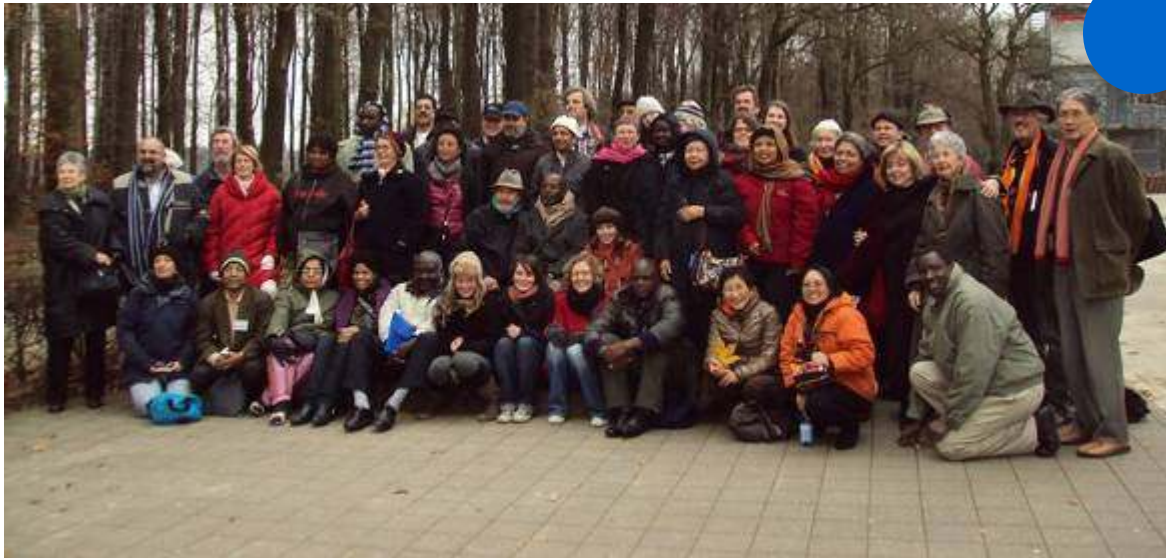
Council Participants 2010

In November 2010 IFOR's Quadrennial Council met in Baarlo, the Netherlands where representatives of IFOR Branches, Groups (by invitation) and Affiliates (BGAs) met together. The international Council is the main governing body of IFOR. During Council a new International Committee (ICOM) and Representative Consultative Committee (RCC) were elected (consult Section 5.1 and 5.2 for more details).