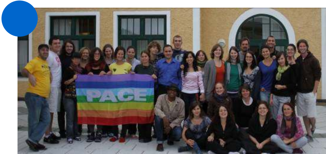
Impressions of IFOR youth activities