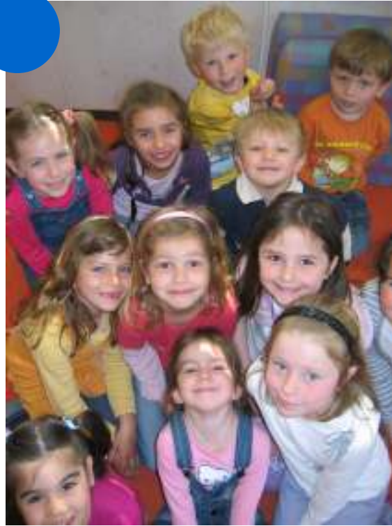
Impressions from a NVE- Partnerkindergarten

Fund, the majority of articles were translated within a short period of time and are now creating a base for a publication in English, German and French. This is thanks to the help of skilled professionals donating a huge