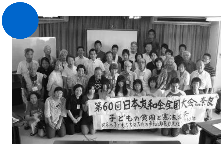
Participants of the Annual National Conference

Every year JFOR holds an Annual Meeting in April, a National Conference in August and various other meetings by local FOR groups. In 2010, the 60 th Annual National Conference was held in Nara, the ancient capital 1,300 years ago. Right after the conference, we co-sponsored the inter-religious, ecumenical meeting to uphold Article 9 for World Peace. Many young people participated in these meetings which encouraged us and our efforts to let younger generations to grow.