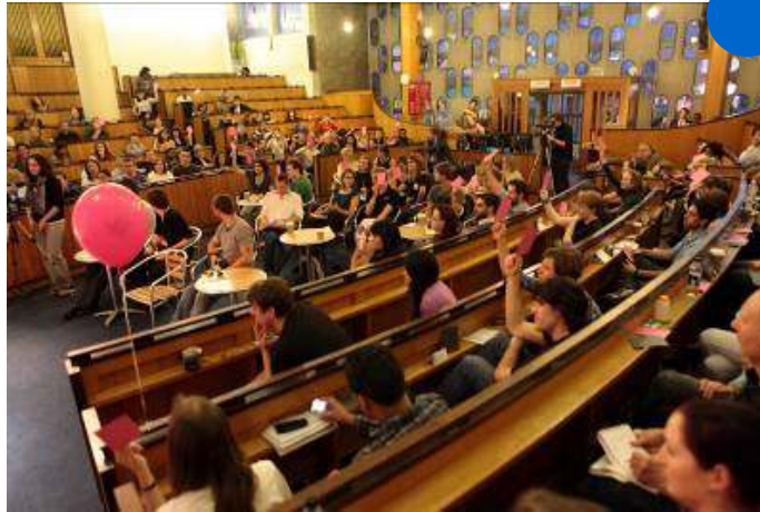
FOR England youth join with UK NGOs to oppose nuclear weapons at the General Election hustings.