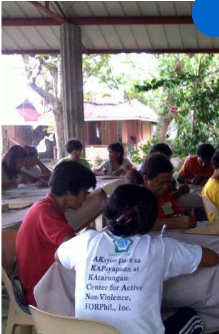
During a workshop organized by AKKAPKA-CANV