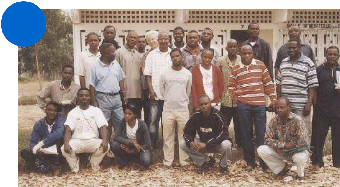
Participants of a training session in Kinkala

Particularly in Pointe-Noire and Brazzaville, MIR Congo pursued the experiment of an "Education Program for nonviolence and peace in schools". 129 young pupils and students with some teachers participated in the initiation weekends. In Pointe-Noire, two weekends on the "nonviolent management of conflicts among groups" attracted 122 young people and adults from the parochial communities.